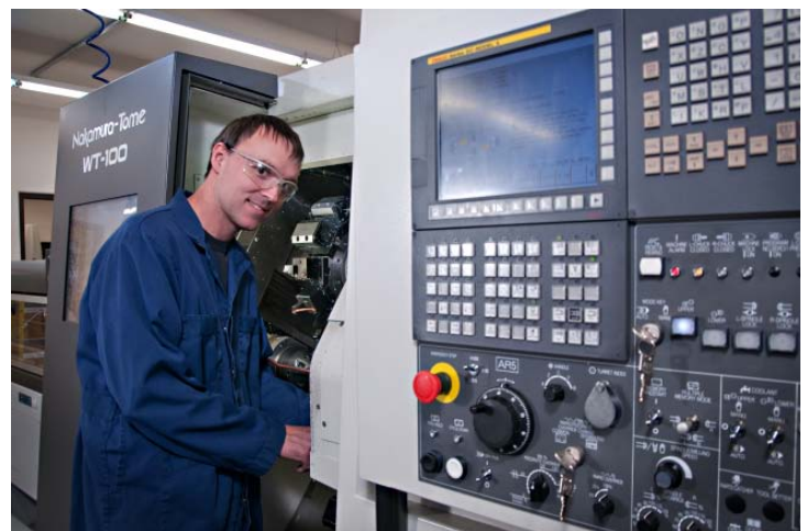
2012 Nakamura WT-100 1-5/8" dia. Bar Capacity, 9-Axis Turning and Milling Center with automated Bar feed and Conveyor.