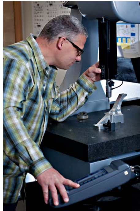
Tesa Micro-Hite 3D Coordinate Measuring Machine (CMM) 18" x 20"